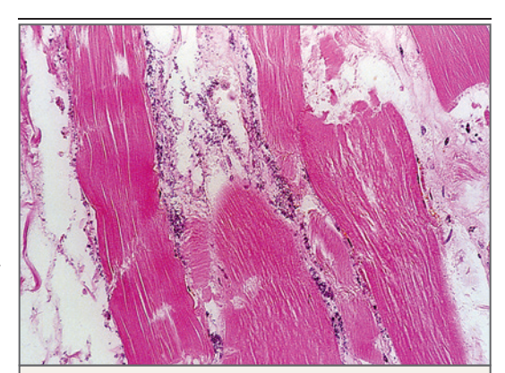
Figure 3. Histopathological Features of Group A Streptococcal Necrotizing Fasciitis and Myonecrosis. Routine hematoxylin and eosin staining of a muscle specimen from a patient who died from cryptogenic group A streptococcal infection shows the classic features of this infection: widespread tissue destruction, lack of a tissue inflammatory response, and large numbers of bacteria in the tissues.

There is universal agreement that early surgical débridement is crucial in managing these complex cases. But how early is early? Pinpointing the critical time for surgical intervention on the basis of published data is problematic, since the starting point for measuring the time to surgery varies among studies, particularly retrospective analyses, with some studies using the time from establishment of a definitive diagno-